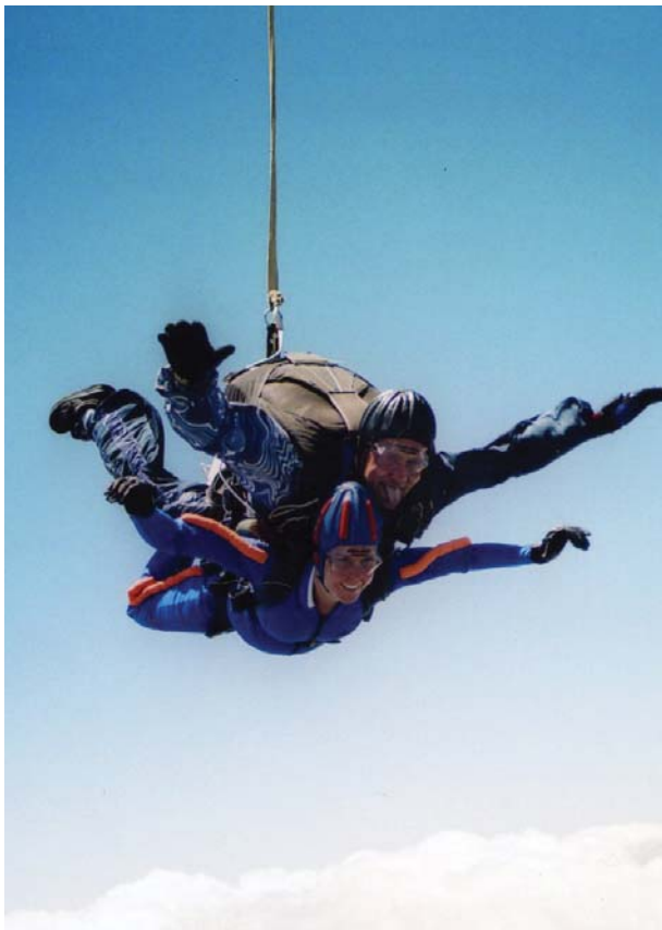
FIGURE 4 Patient resuming “normal” life activities post-evisceration surgery.

cant alteration of her sleep-wake cycle after initial visual loss. In fact, the elimination of ocular pain by evisceration actually helped improve sleep cycles in this patient.