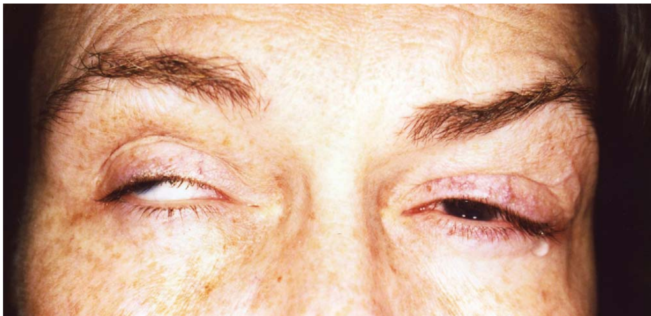
FIGURE 1 Before evisceration.

rant. The patient was aphakic bilaterally, and there was no view of the posterior pole in either eye. A CT scan showed a large buckle around each eye but was otherwise normal. There were no ocular masses. The remainder of her exam was unremarkable.