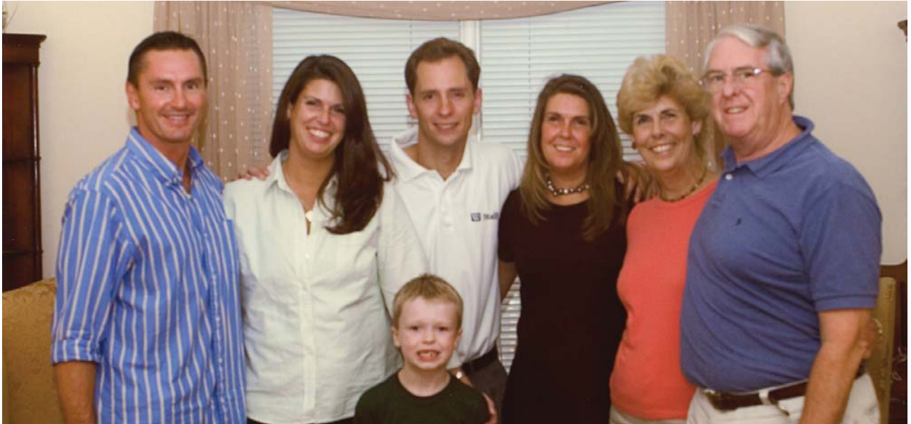
FIGURE 3 Patient (third from right) with her family post-surgery.