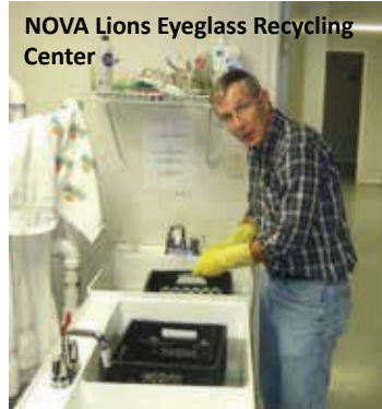
NOVA Lions Eyeglass Recycling Center