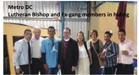
Metro DC Lutheran Bishop and Ex-gang members in hiding