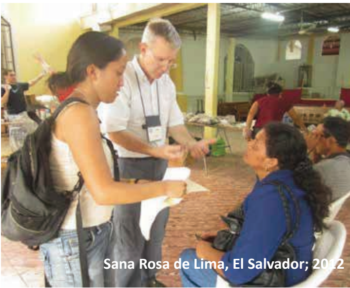
Sana Rosa de Lima, El Salvador; 2012