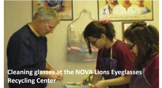
Cleaning glasses at the NOVA Lions Eyeglasses Recycling Center